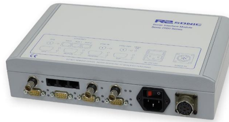
Sonar Interface Module

*Max sounding depths depend on environmental conditions